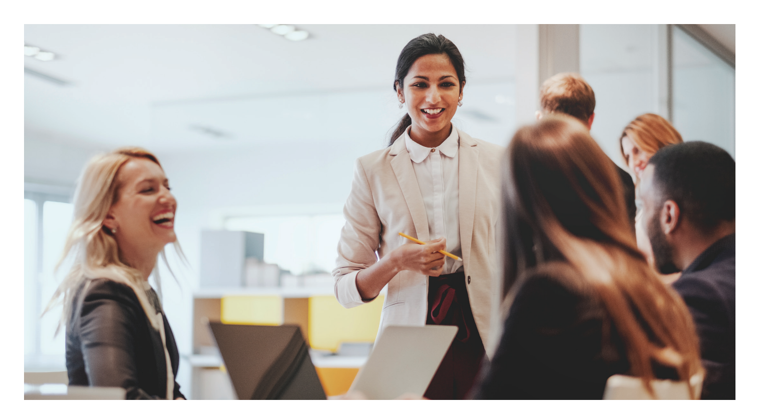
The Top Five Commonly Missed Errors