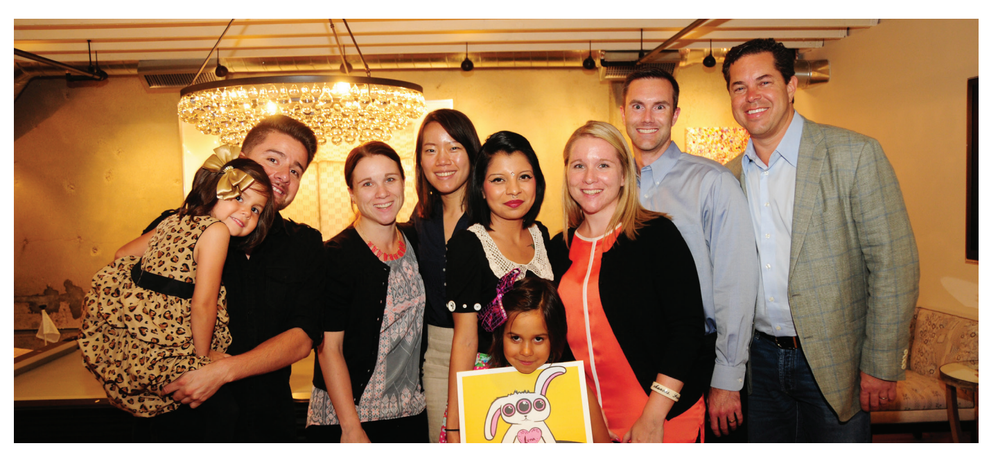
We regularly lend our space to nonprofit organizations for events, such as a screening of an Oscar-winning film in celebration of American Artist Appreciation Month with special guest, Inocente.