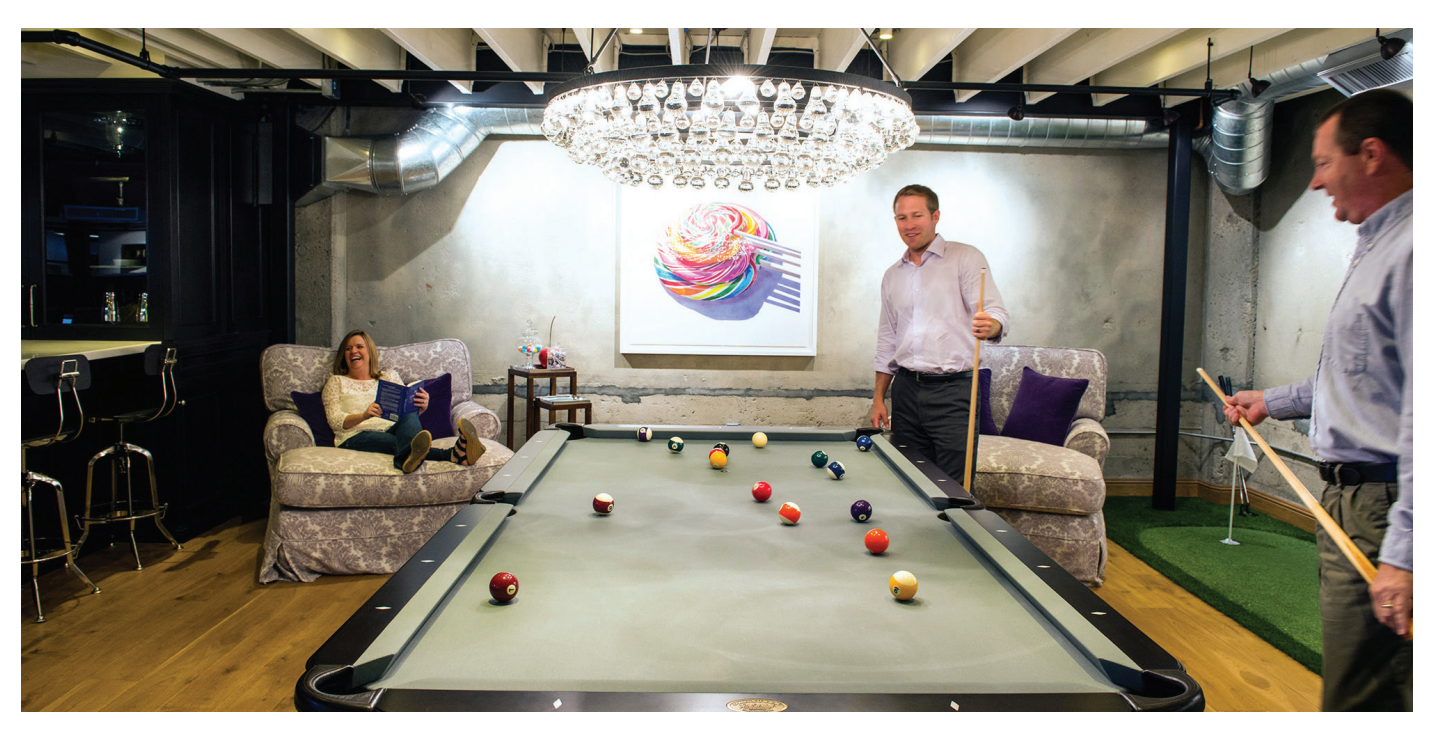
Our game rooms are the perfect place for a little friendly competition!