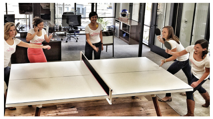
Our team members make daily use of our ping pong tables.