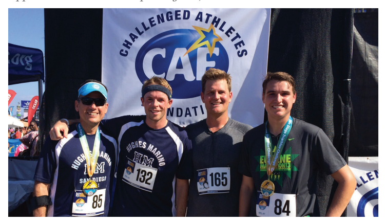
Hughes Marino team members participated in a race for the Challenged Athletes Foundation.