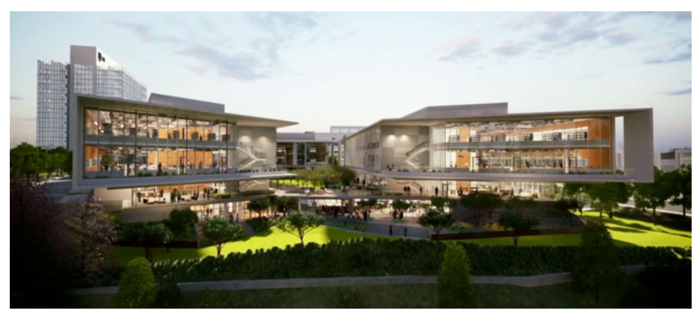
i3 is one of several new developments that will be competing for life science tenants in the next 12-24 months.

sizes available to smaller lab tenants. Alexandria is also in active negotiations with larger tenants to convert its two older buildings on Merryfield Drive, adjacent to Spectrum 1 & 2, which are being vacated by Sapphire Energy and The Scripps Research Institute to create a 150,000 square foot Spectrum 3 & 4 build-to-suit project. All of these buildings, as well as Alexandria's entire portfolio, are being served by its new 80,000 square foot Franklin Yard amenities building on Torreyana, where Biocom recently relocated.