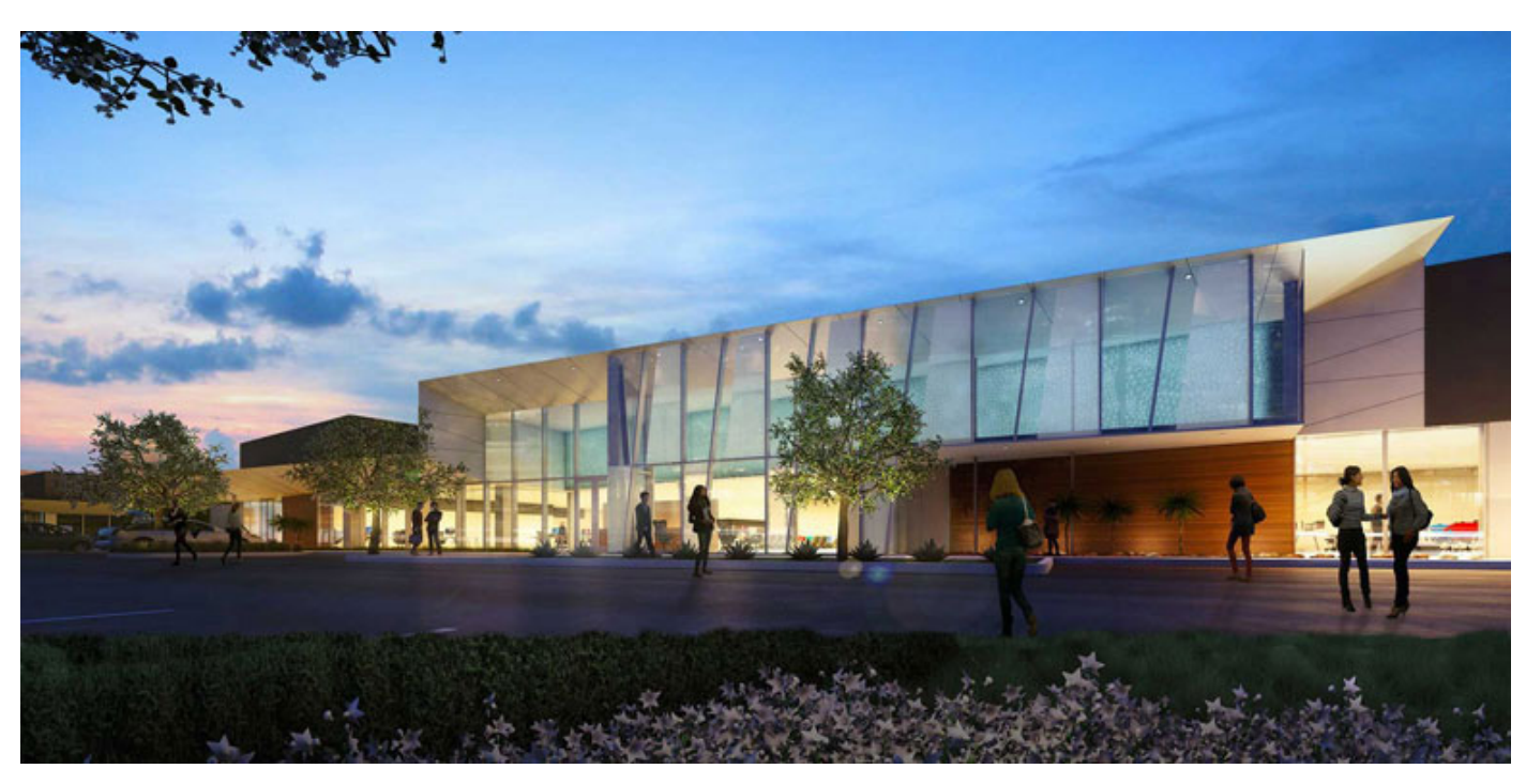
The Moda Sorrento project in Sorrento Mesa is slated to complete this summer.