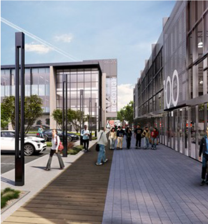
Alexandria's proposed project on Town Centre Drive will draw additional life science tenants to UTC.