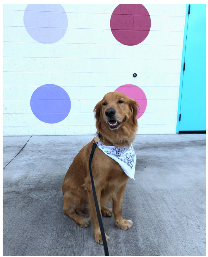
Dogs\ are\ linked\ to\ helping\ reduce\ stress\ in\ the\ workplace,\ and\ we\ love\ when\ they\ come\ to\ visit!