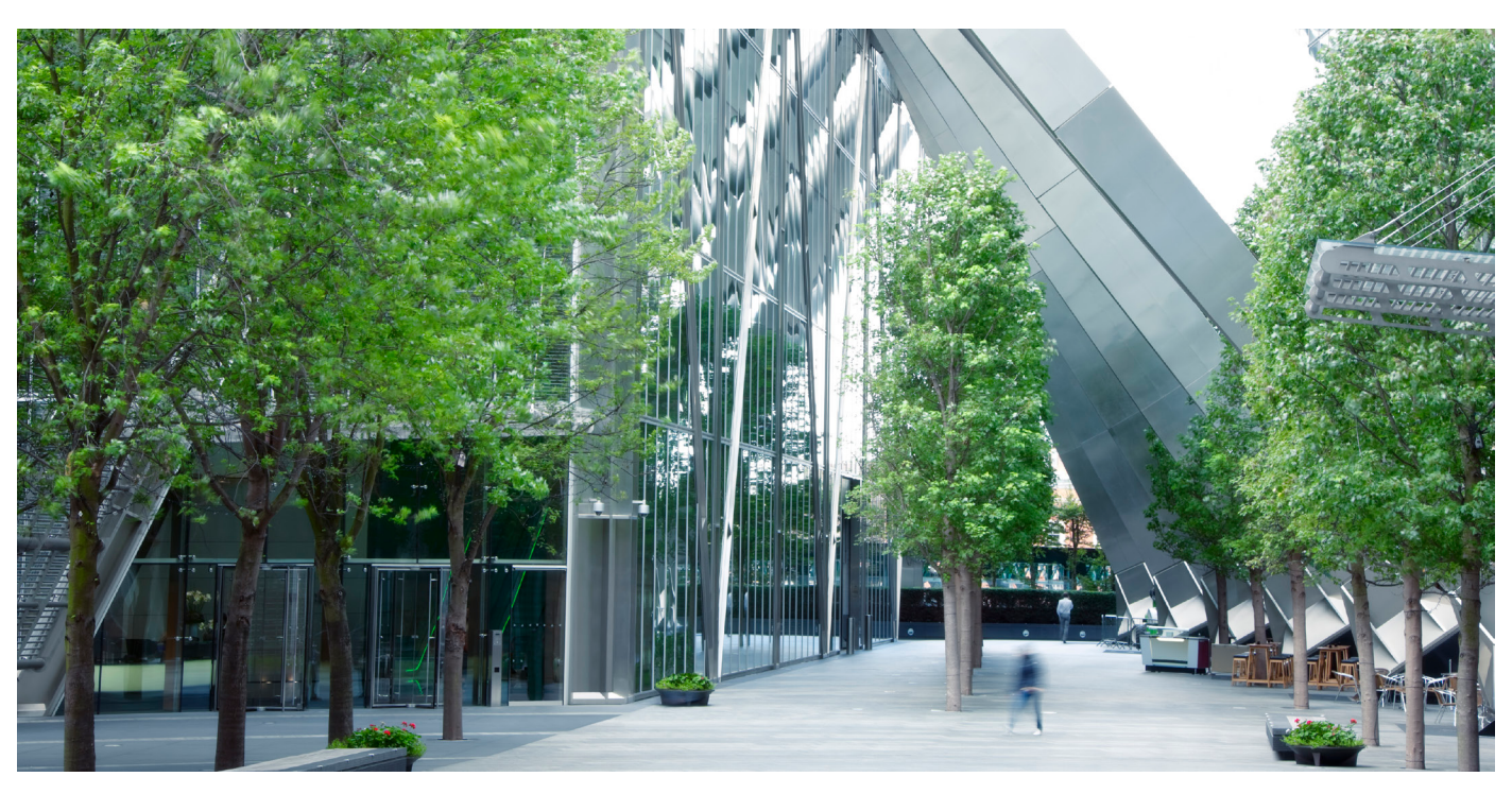
Small steps toward a greener workplace can have a big impact on energy, water and cost savings.

are also available, so keep that in mind when it's time for new IT equipment.