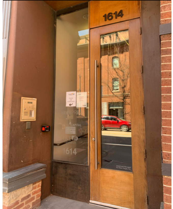
BUILDING FRONT DOOR

Walk to 15th street, turn right and walk to our building