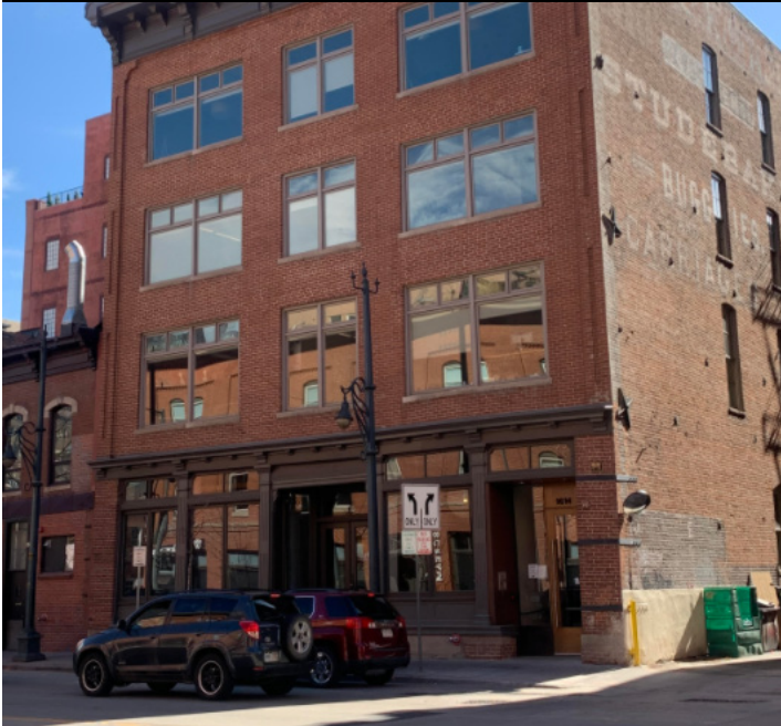
HUGHES MARINO OFFICE

Walk to 15th street, turn right and walk to our building