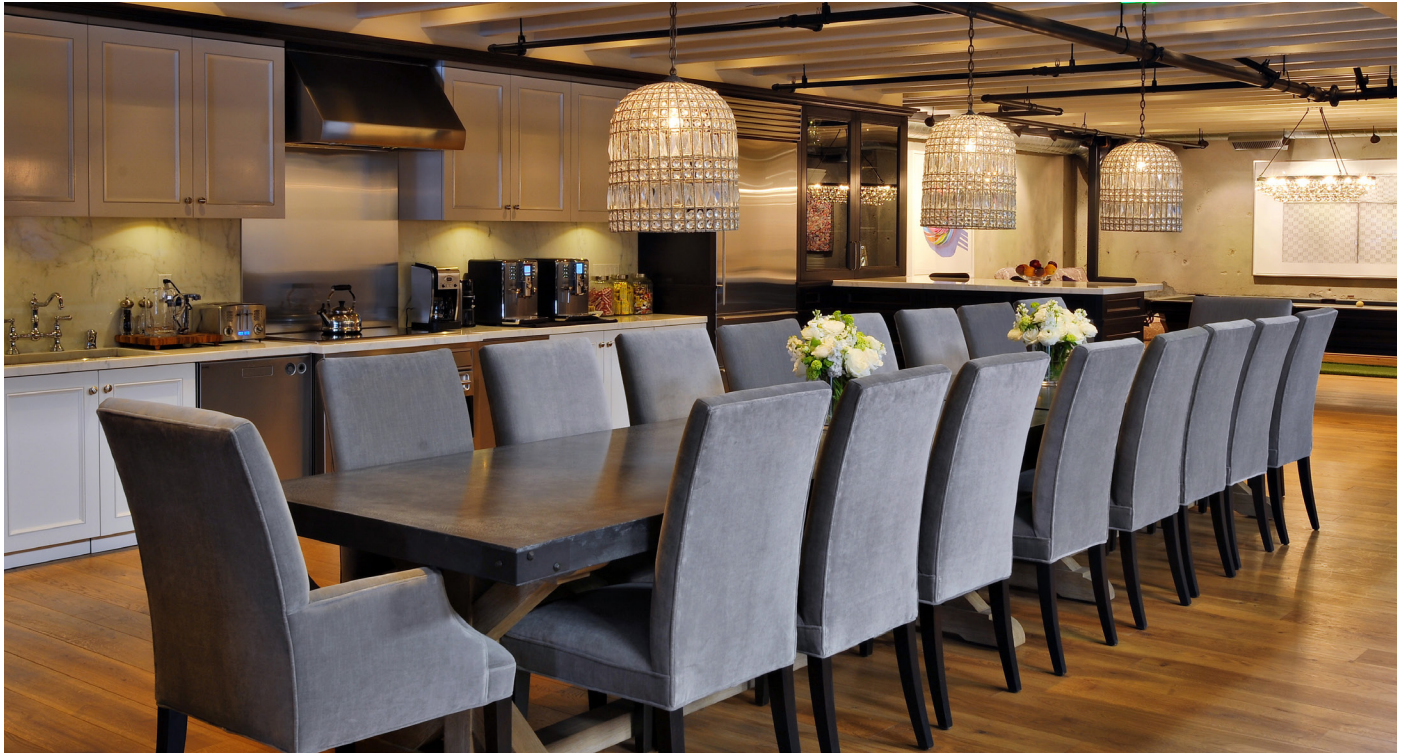
An oversized family-style farm table makes a natural gathering place for meals and meetings.