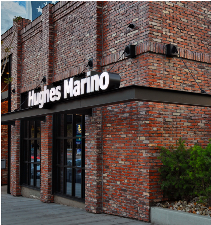
By incorporating rustic details like hardwood floors and salvaged bricks, we kept the character of our historical building intact.