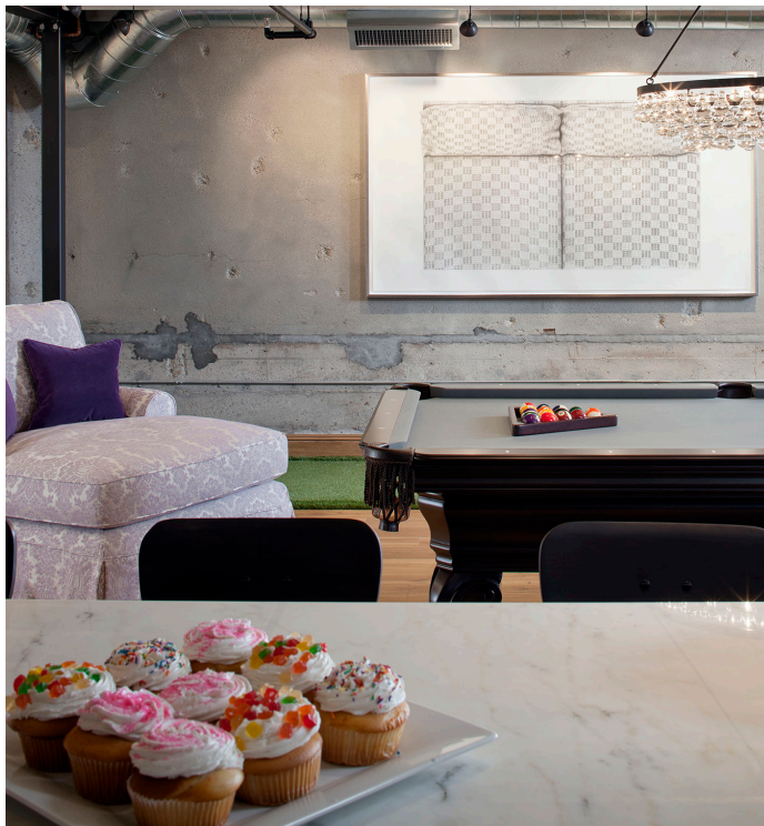
Fully equipped with a pool table and putting green, our office was designed to relieve workday stress and promote fun.