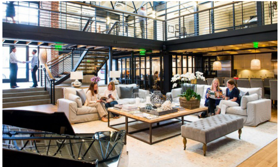
An inviting living room with comfortable sofas, leather chairs and an 80" high-definition television is at the heart of our San Diego headquarters.

Working with architecture firm Gensler, Shay created a home environment with a 'living room' at the center of the ground floor. The atrium style space boasts shabby chic couches, loveseats, a coffee table, and an 80" high-definition television which streams more than 800 photos of employees and their families in a continuous slideshow. There's a baby-grand piano, which is played frequently by employees and guests, and several guitars are on hand