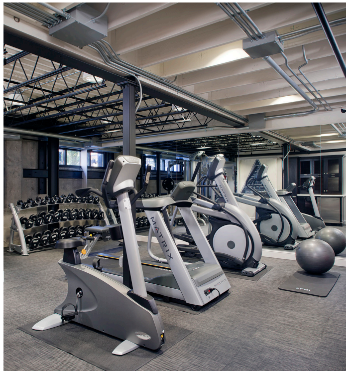
Our building also has a gym, including lockers and showers available for team members.