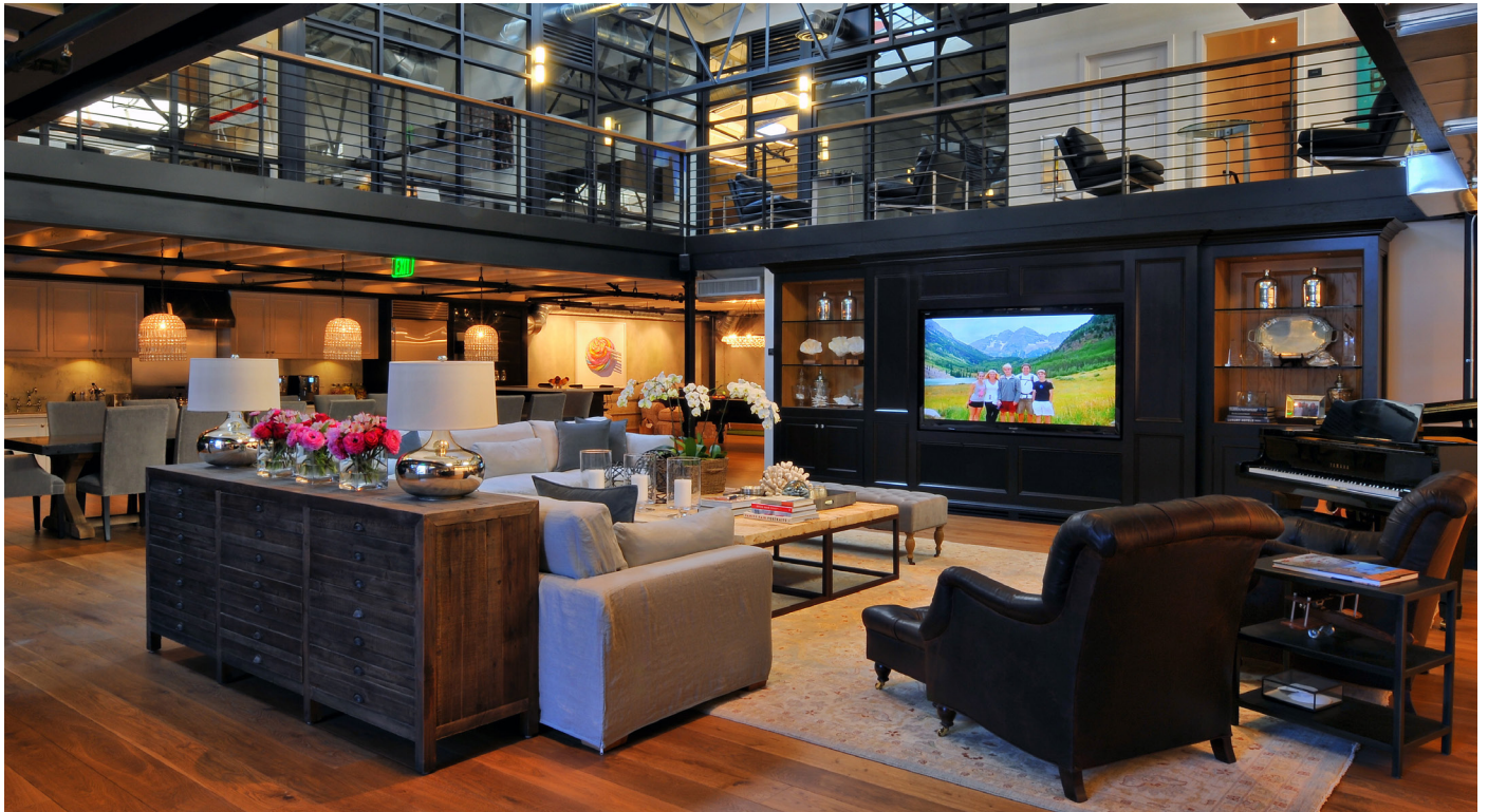
From custom lighting fixtures to plush amenities, Hughes Marino creates a home away from home, full of personal touches.