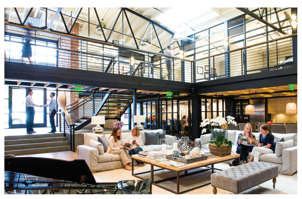
An inviting living room with comfortable sofas, leather chairs and an 80" highdefinition television is at the heart of our San Diego headquarters.

Working with architecture firm Gensler, Shay created a home environment with a 'living room' at the center of the ground floor. The atrium style space boasts shabby chic couches, loveseats, a coffee table, and an 80" high-definition television which streams more than 800 photos of employees and their families in a continuous slideshow. There's a baby-grand piano, which is played frequently by employees and