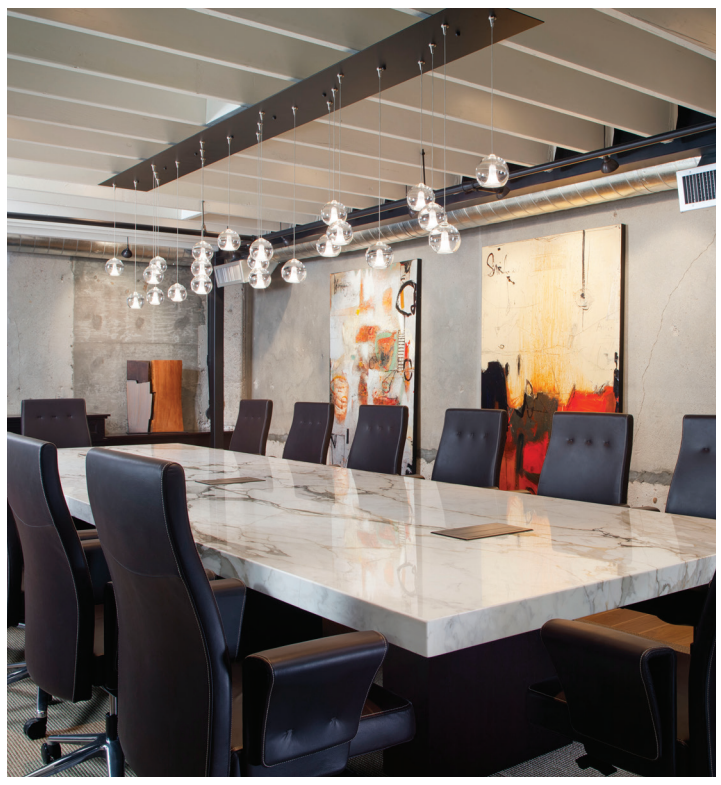
Our spacious first floor conference room is the perfect place for teams to get down to business.