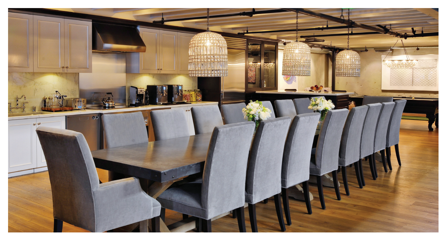
An oversized family-style farm table makes a natural gathering place for meals and meetings.