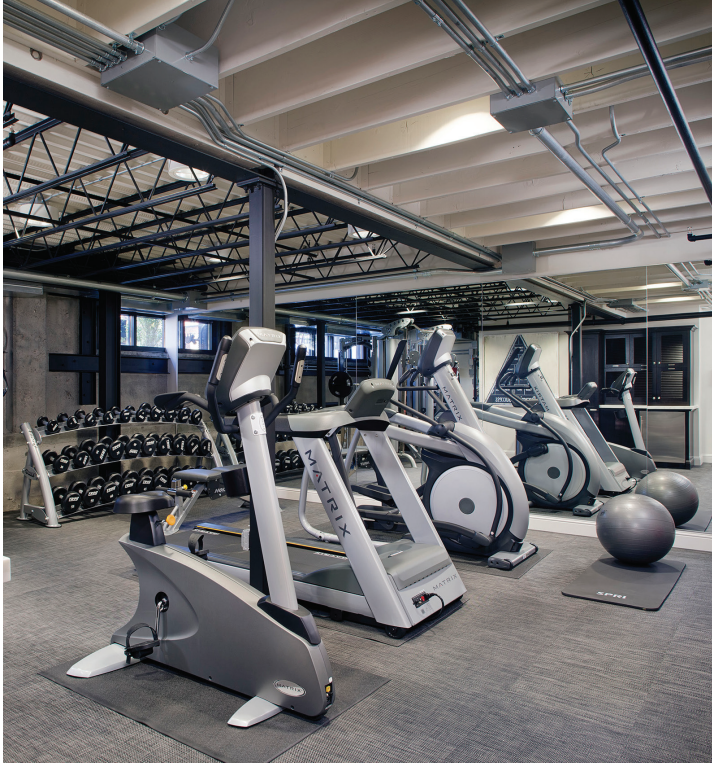
available for team members.