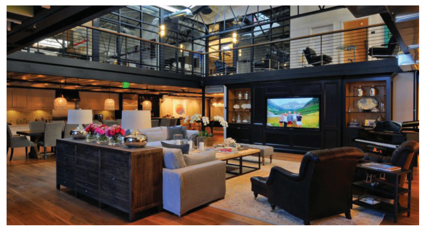
From custom lighting fixtures to plush amenities, Hughes Marino creates a home away from home, full of personal touches.