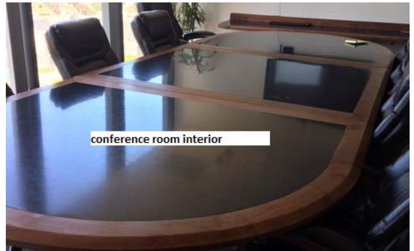
conference room interior