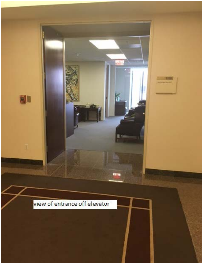
view of entrance off elevator