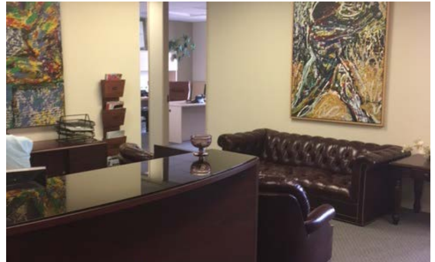
conference room interior